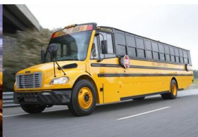
New & Used Buses